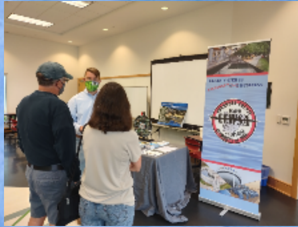
Goshen Valley Boys Ranch Adopt-A-Stream Training

Drinking Water Week community presentation - Reinhart University