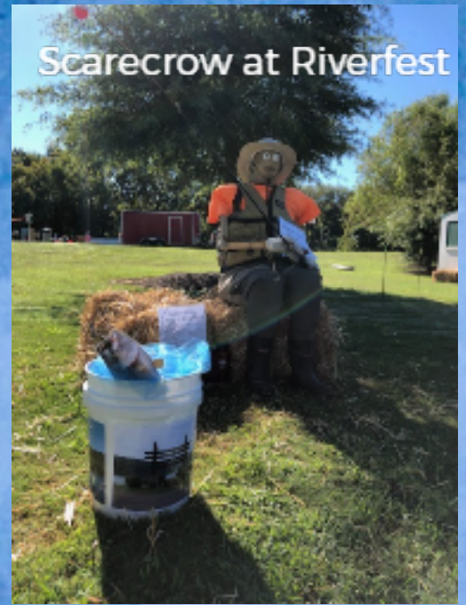
Scarecrow at Riverfest