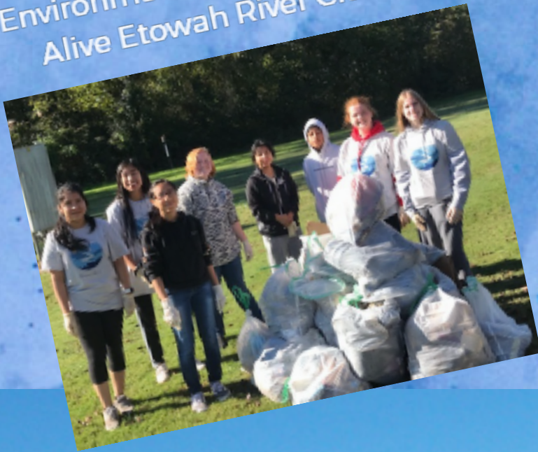
Cherokee High School Environmental Club at the Rivers Alive Etowah River Clean-up