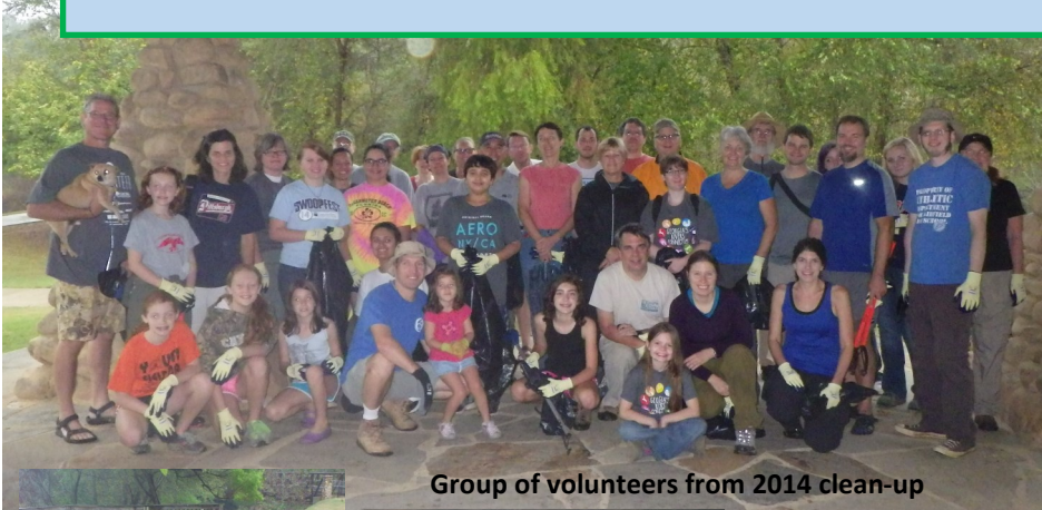
Group of volunteers from 2014 clean-up