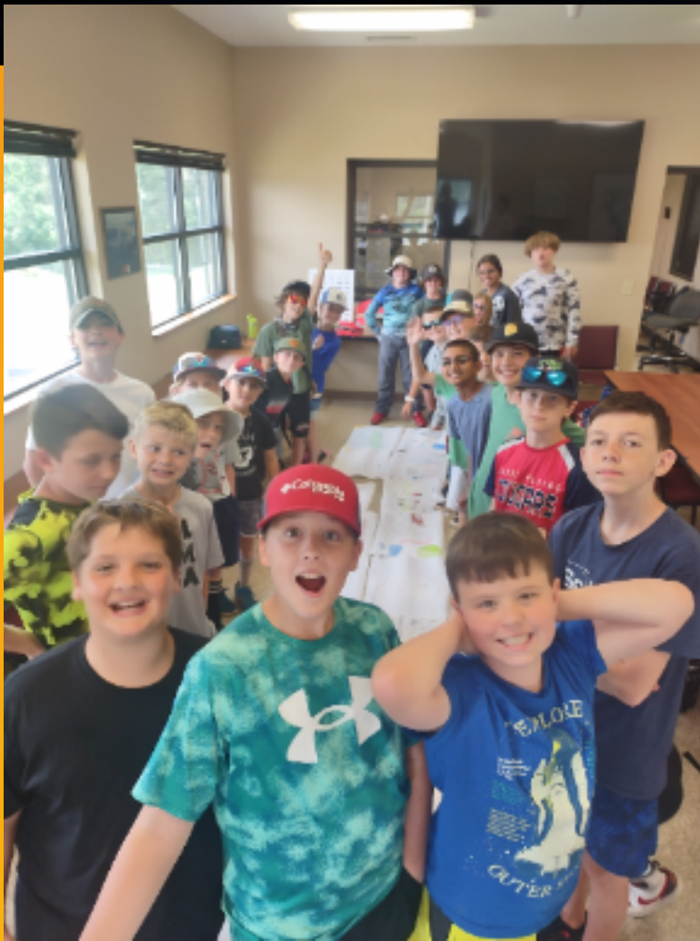
CPRA Fish Camp at Hollis Q. Lathem Reservoir