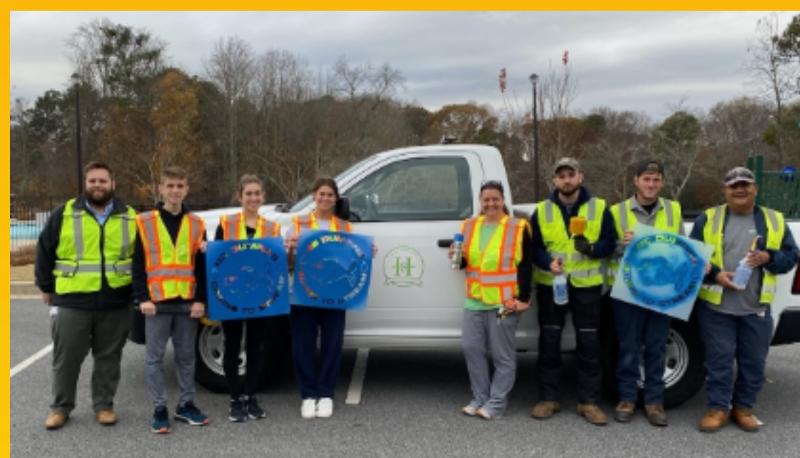
Stormdrain Marking Event with City of Holly Springs