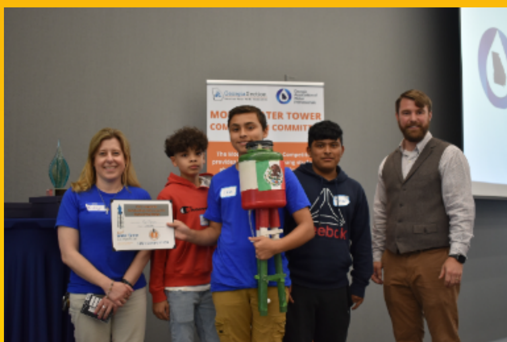
Model Water Tower Competition winners 1st Place Cherokee County Best Engineering Design - State