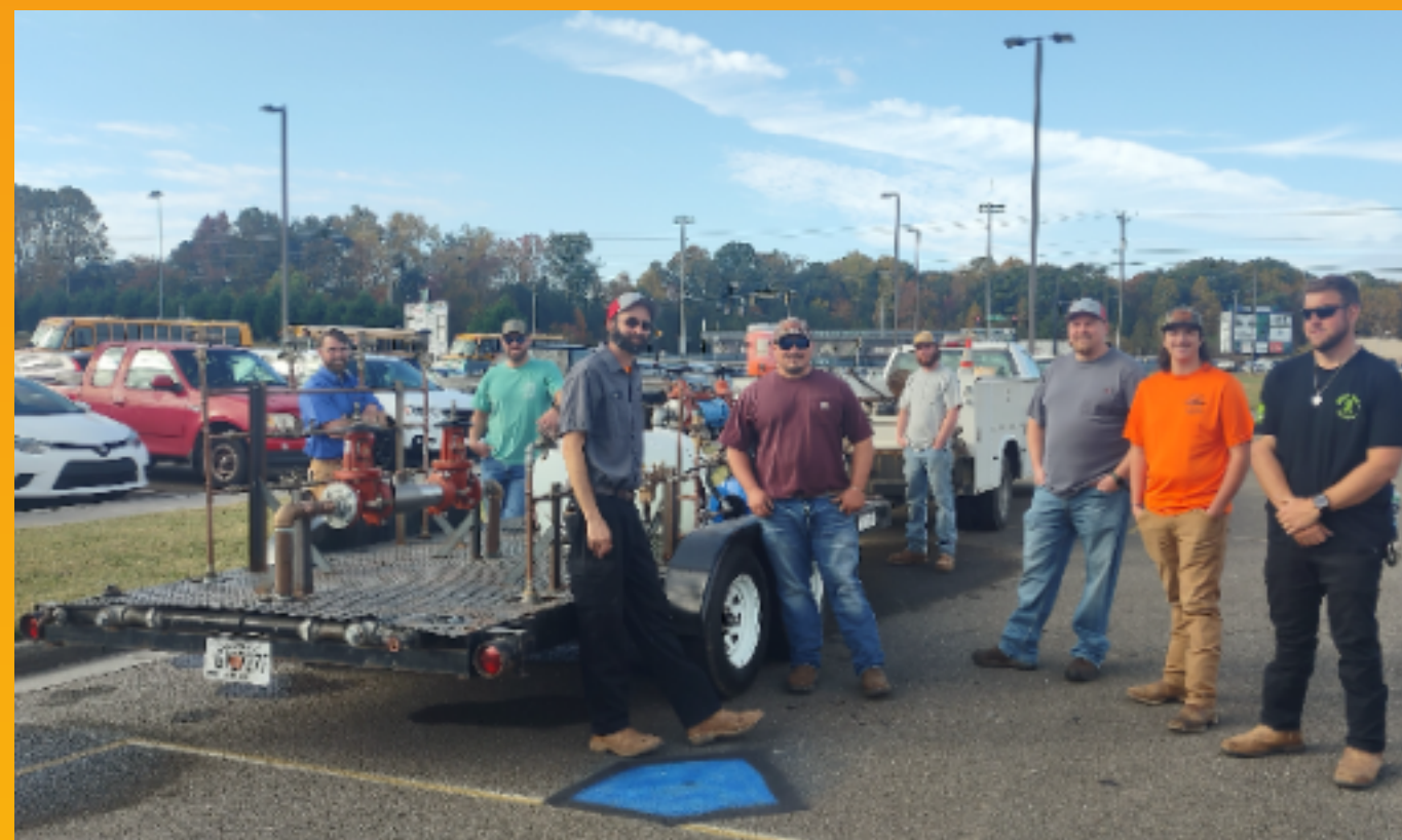
Touch-A-Truck/Career Day Event - Creekland MS