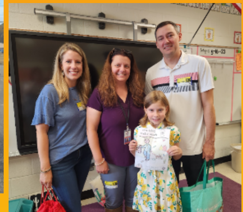
Drinking Water Week coloring contest Most Creative